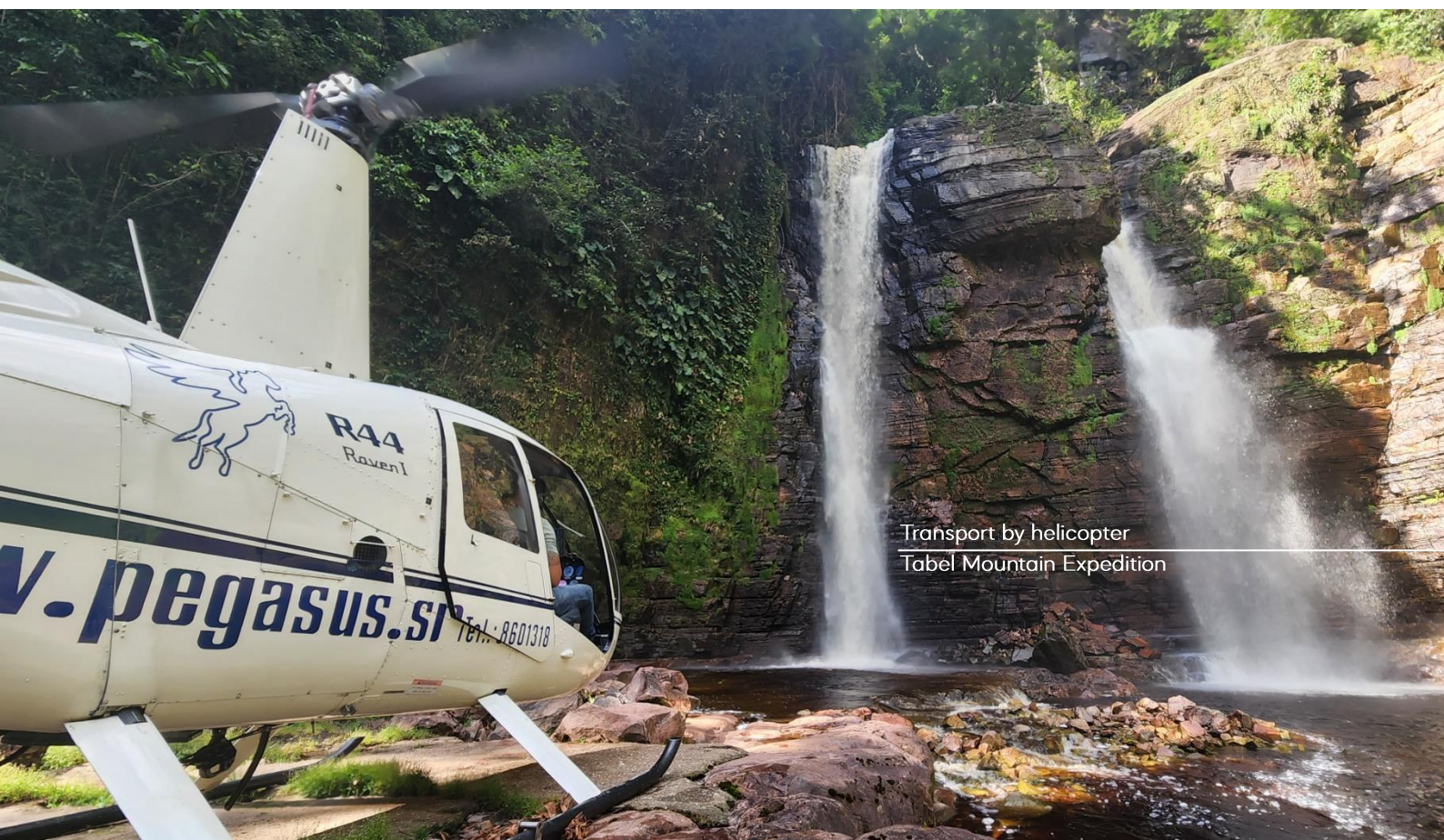
Transport by helicopter Tabel Mountain Expedition

Many of the expeditions take place in remote areas which are only accessible by helicopter or a small airplane. These airlines can be very strict on weight per person and their kit. Make sure you have provided your own personal weight to us so you can receive proper instructions on the total weight everyone is allowed to carry with them.