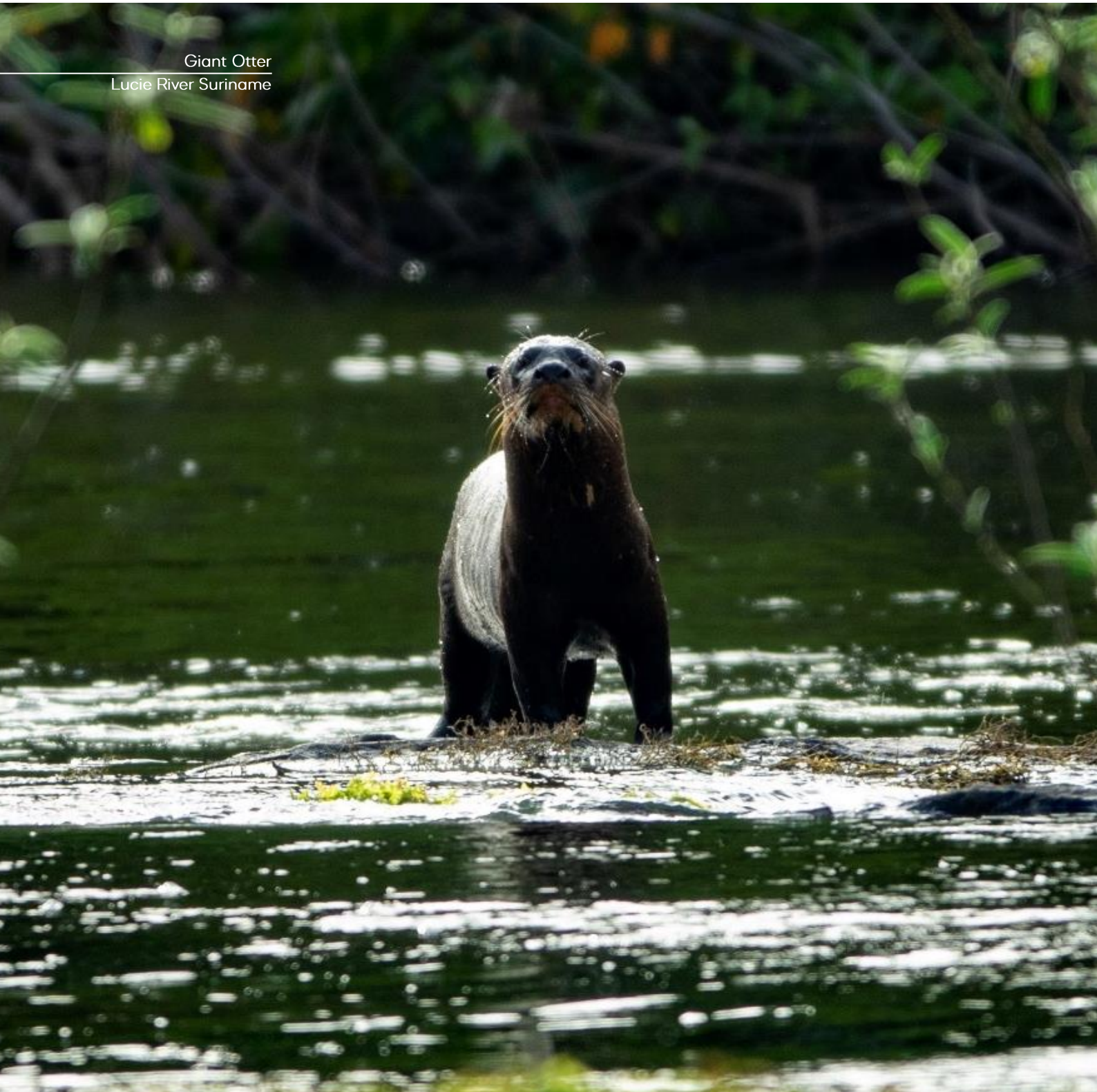
Giant Otter Lucie River Suriname

If you have any questions you'd like to have answered before that, you are always welcome to contact us.