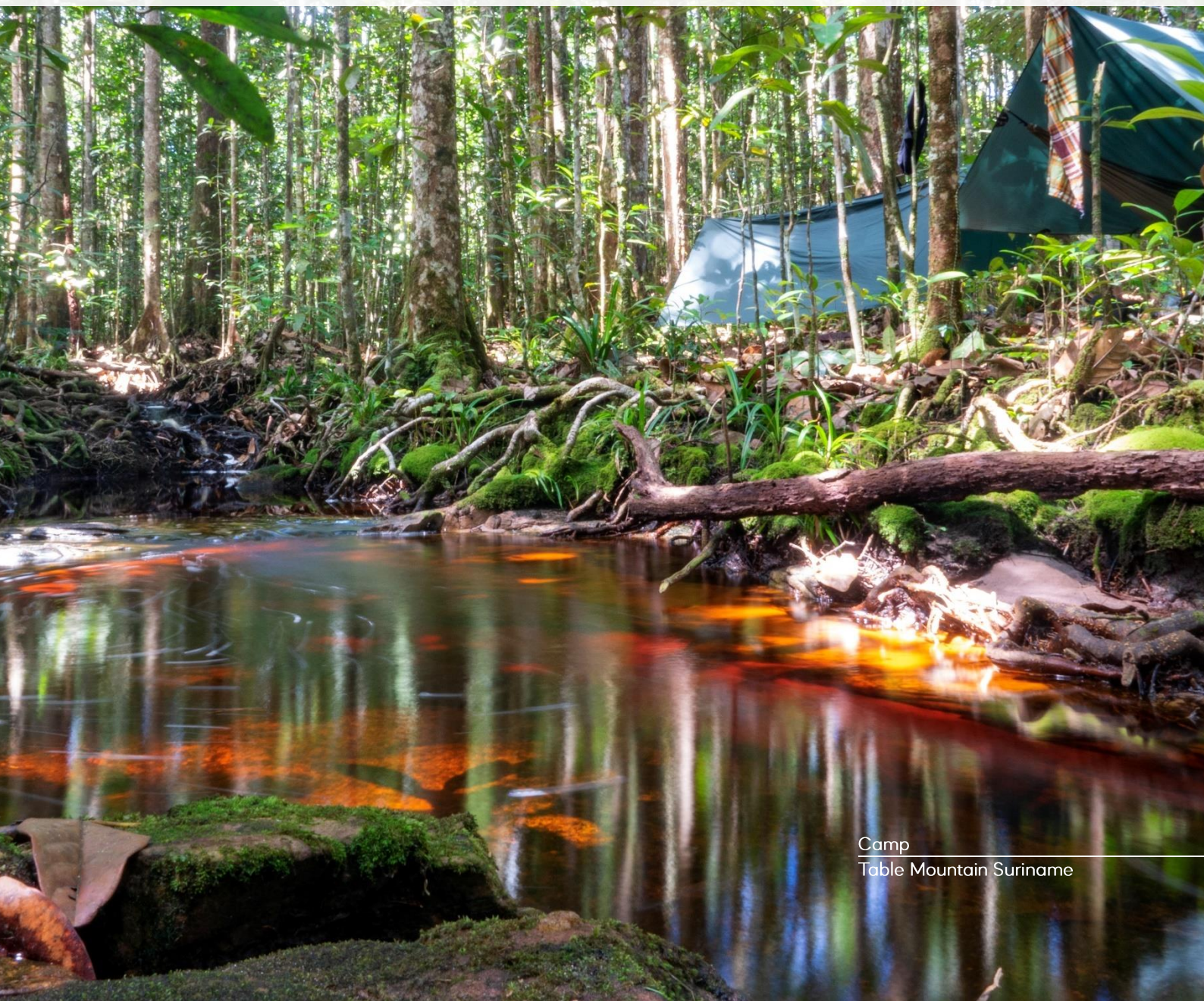
Camp Table Mountain Suriname