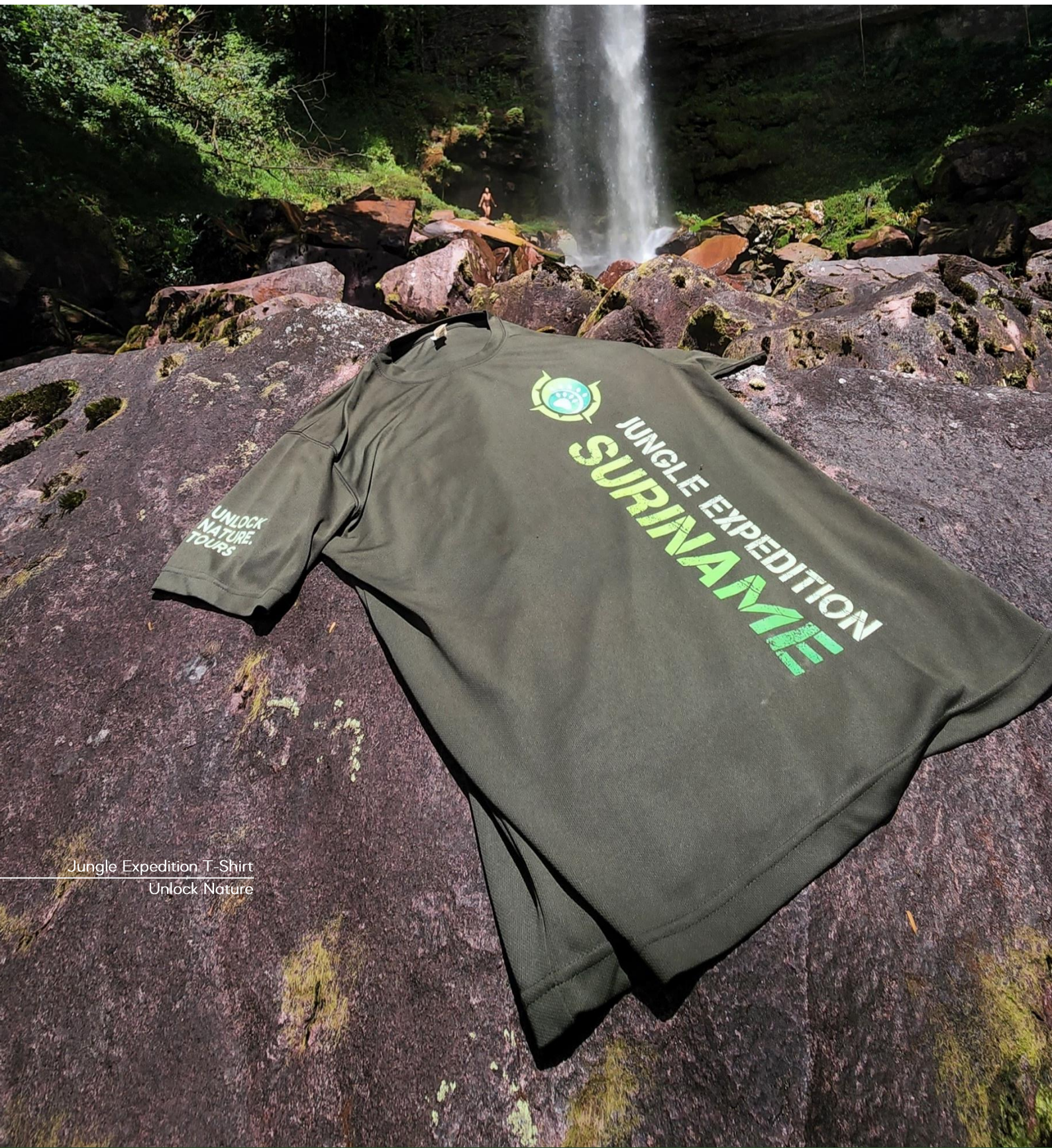
Jungle Expedition T-Shirt Unlock Nature

Such an expedition is not only an experience in the field but also the process towards it. Preparing all your gear is also preparing your mind! We know that these kinds of travels are often a life-changing experience, making you more grounded, respectful to nature and aware of the beauty of this world. Are you up for the adventure of a lifetime?